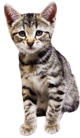
8 week old kitten